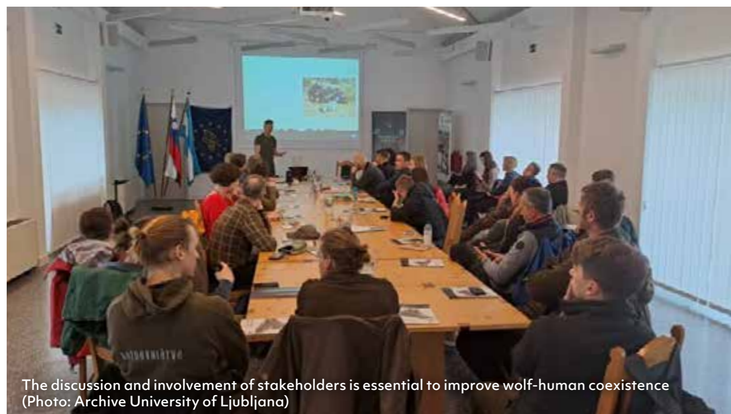
The discussion and involvement of stakeholders is essential to improve wolf-human coexistence