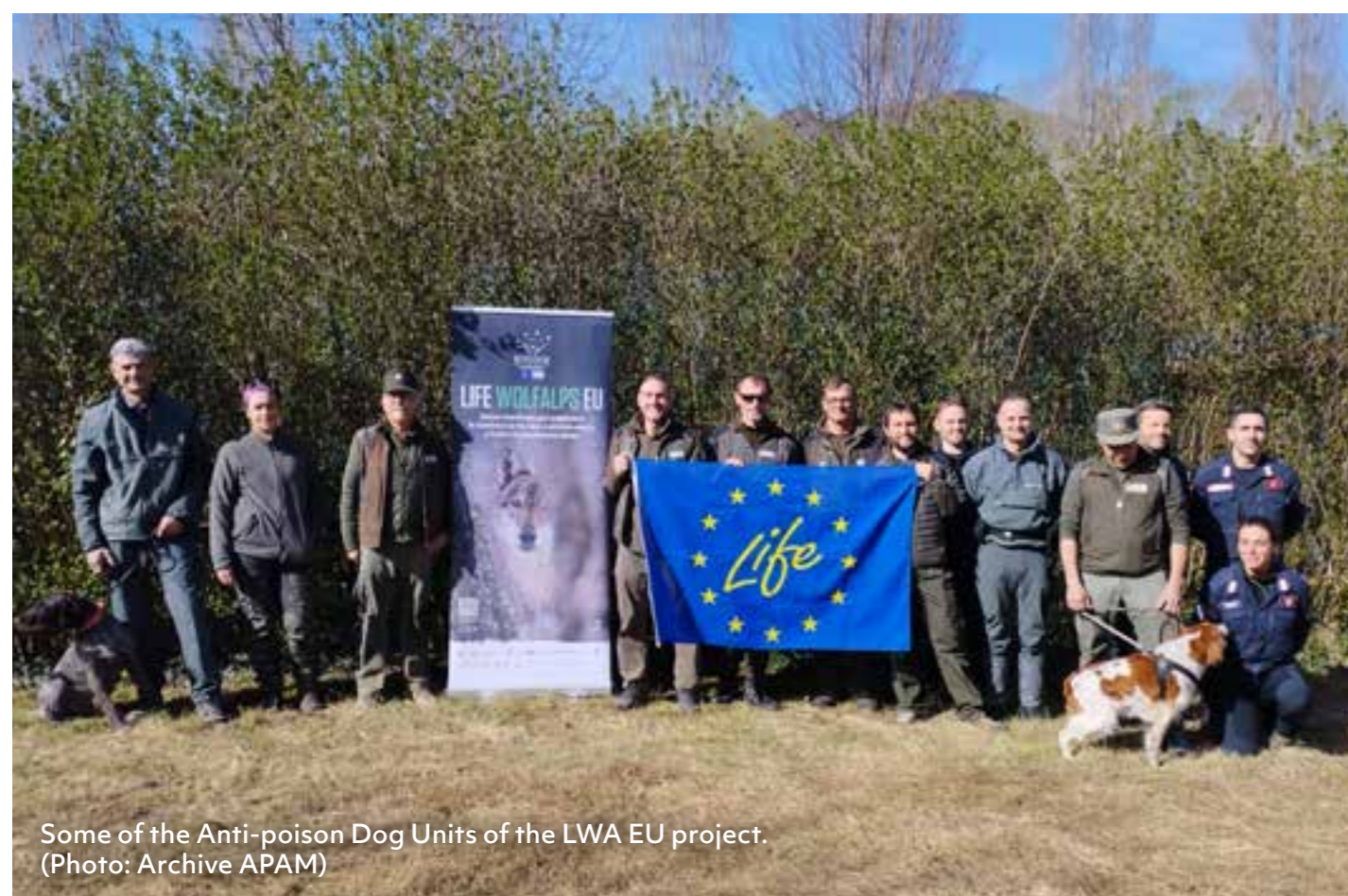
Some of the Anti-poison Dog Units of the LWA EU project.