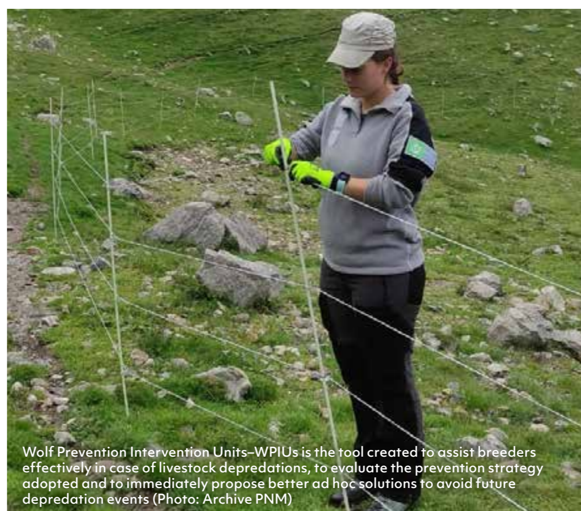
Wolf Prevention Intervention Units-WPIUs is the tool created to assist breeders effectively in case of livestock depredations, to evaluate the prevention strategy adopted and to immediately propose better ad hoc solutions to avoid future depredation events

During the last 30 years, a natural return of wolves has been recorded at local, national and international levels over several mountain ranges in the Alps and, more recently, in both hilly and plain areas. Accepting the natural return of wolves in human-dominated landscapes is a major challenge, especially in places where memories and experience of coexistence have been lost. At the end of the first LIFE WolfAlps project (2013–2018), the European Commission approved and financed a new project that, for the first time, works on a European and pan-Alpine scale for the improvement of wolf-human coexistence through a participatory approach, in order to guarantee the long-term conservation of the transboundary wolf population.