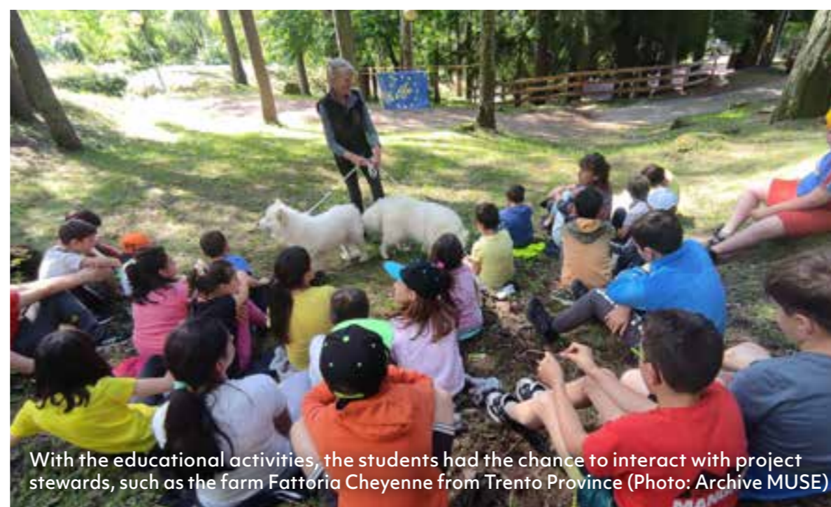
With the educational activities, the students had the chance to interact with project stewards, such as the farm Fattoria Cheyenne from Trento Province