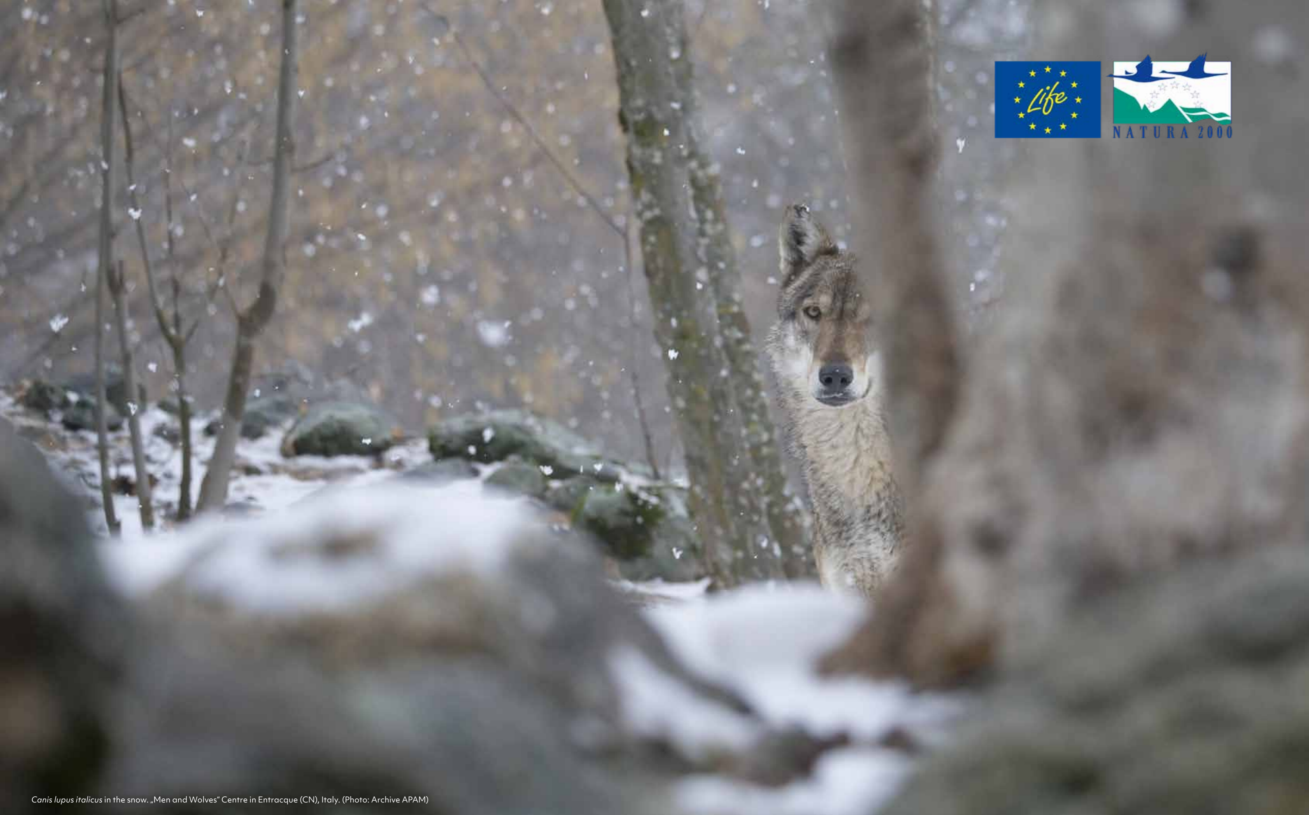
Canis lupus italicus in the snow. „Men and Wolves“ Centre in Entracque (CN), Italy.